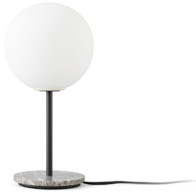
Grey Marble with Matt Opal