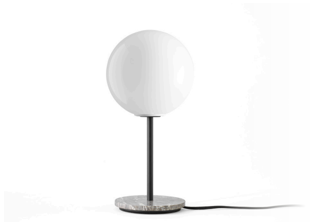
Grey Marble with Shiny Opal