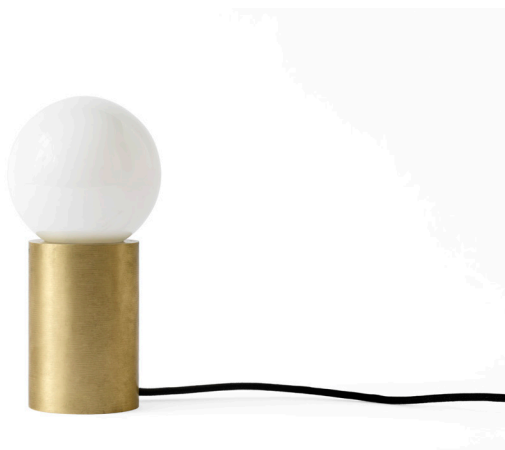
Brushed Brass 1750839