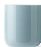
Cool Green 4534410