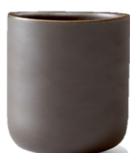
Dark Glazed 4534530