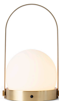
Brushed Brass 4863539