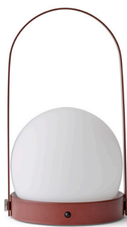
Burned Red 4863349