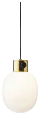
Polished Brass 1820839