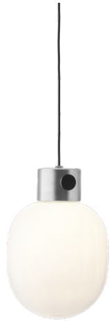
Brushed Steel 1820039